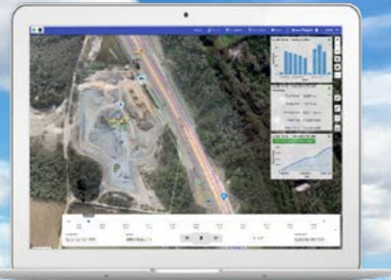
Custom aerial and 3D imagery

Real-time data gives visibility of project operations to relevant staff members, allowing them to make faster decisions on expensive activities from any location.