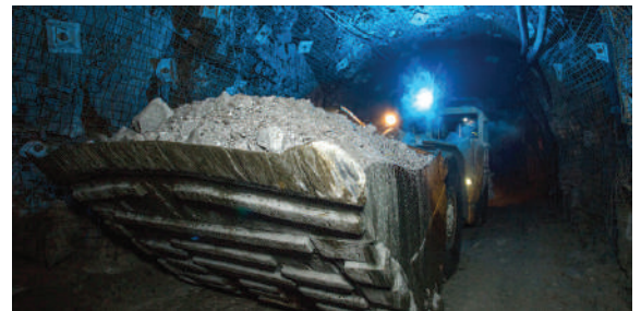
Enables tele-operation of an LHD between shifts and autonomous control from the muck pile to the ore pass.