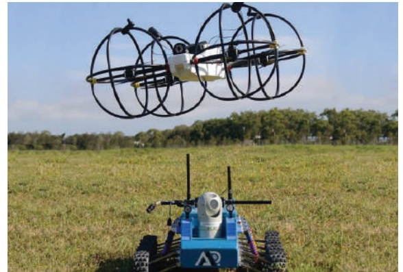
Australian Droid + Robot's Explora droids for underground inspections has Rajant's BreadCrumb technology integrated