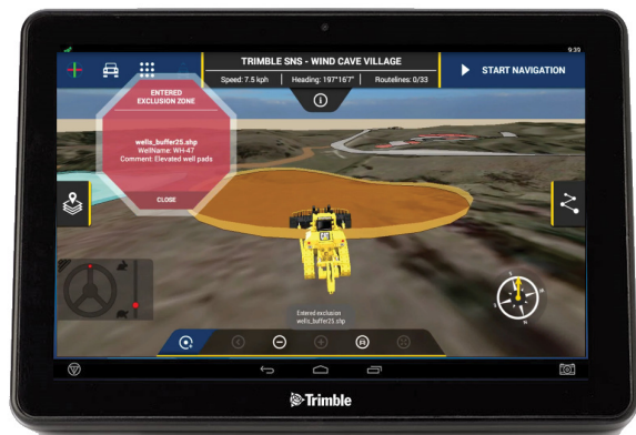
Visual Warning 2: Entered Exclusion Zone