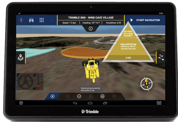
Visual Warning 1: Entered Exclusion Proximity