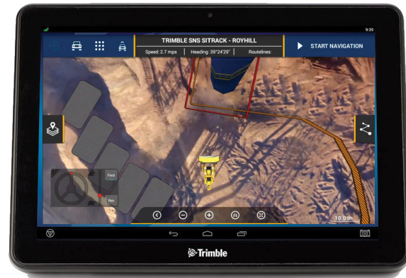
Visual Display - All clear

Proximity and breach zones provide visual and audible alerts and warnings for an operator, or mechanical warnings and shut-offs for remote controlled or autonomous vehicles. SNS SiTRACK provides the highest level of safety to prevent harm to operators and damage to key assets.