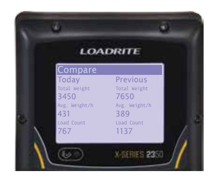
Performance data is stored to allow the operator to compare performance vs. previous, average and best shift