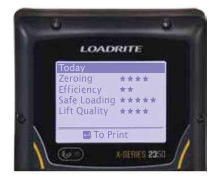
Operators are given a rating to quickly understand performance