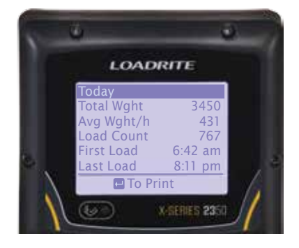
In-cab metrics feedback to the operator during the shift

Trimble introduces a new range of metrics to empower the operator to perform. These metrics help the operator improve accuracy and efficiency each day, compare with personal bests and provide a real-time star rating. Metrics cover loading accuracy, consistency, safety to encourage operators to monitor performance and improve.